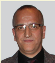
Mechanical Maintenance Technician of Alarko Carrier Sanayi ve Ticaret A.Ş. Ancillary Works Management