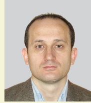
Chief Accountant of the Ukraine-Kiev Boryspol Airport Project of the Contracting Group

Those who qualified for the Golden Pin were honored during the last ceremony of Alarko Day. The Golden Pin has been given every year since 1983 to those who work in affiliated companies, have shown outstanding performance. Those who have been referred by the relevant executive and have qualified for the Golden Pin in accordance with the decision