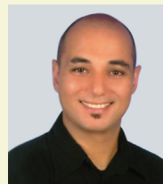
Production Manager of Hillside Beach Club of the Tourism Group