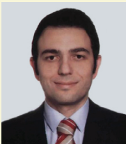
Assistant Manager of Alarko Carrier Sanayi ve Ticaret A.Ş. R&D Heat Department