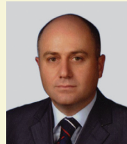
Stock Management Manager of the Industry and Trade Group