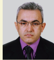
Chief Proposal Engineer of the Contracting Group