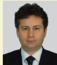
Assistant Sales Manager - System Sales of the Industry and Trade Group