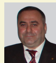
Storehouse Chief of the Sea Products Group