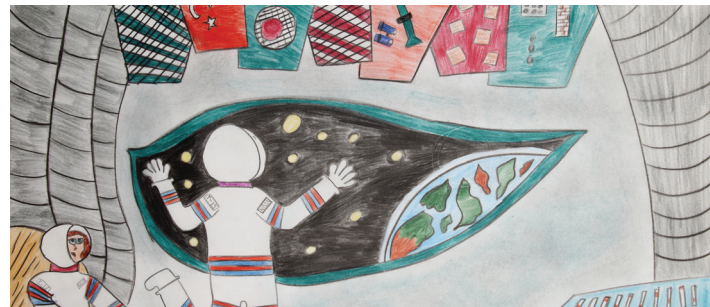
Honorable Mention – Ezgi Yapıcı - İstanbul