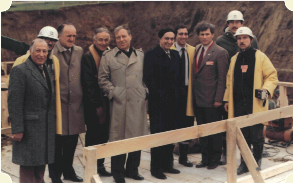
Alkent Etiler - 1985